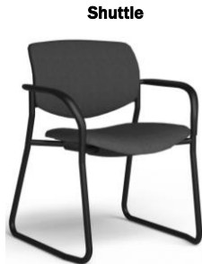
1230 All Plastic